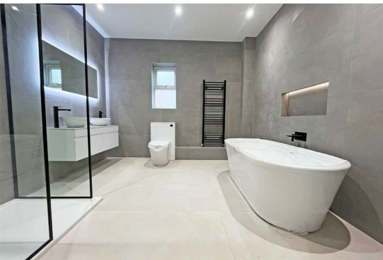
Family Bathroom 10'7" x 10'4" (3.25m x 3.16m)